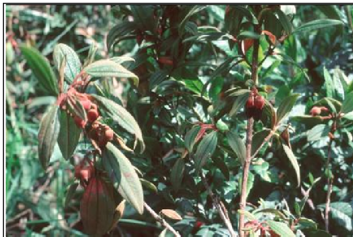
Figure 1. Brachyotum microdon , Melastomataceae

Fractions 7 to 9 ( IC_{50} < 0.25 mg/ml, 3487 mg) were joined and chromatographed on a Flash column eluted with CH_2Cl_2 - AcOEt - MeOH mixtures to yield 11 fractions. Fraction 3 provided a mixture of fatty alcohols (18.6 mg, IC_{50} : 0.2 mg/ml) after a PTLC with CHCl_3 (Rf= 0.16 an orange spot visualized with H_2SO_4 , 25%). This mixture corresponds to C_{34}H_{70}O , C_{32}H_{66}O , C_{30}H_{62}O , C_{28}H_{58}O and C_{26}H_{54}O . Fraction 7 was chromatographed on silica gel with CH_2Cl_2 - AcOEt (95:5) to give 2 sub-fractions. From sub-fraction 2 and after crystallization from methanol, \beta -sitosterol ( 1 ) (15mg, IC_{50} : 0.2 mg/ml) was obtained. Fraction 9 (82.2 mg, IC_{50} : 0.19 mg/ml) was subjected to a size exclusion chromatography with sephadex LH-20 to give 5 sub-fractions. Sub-fraction 3 (34 mg) was further purified by PTLC ( CH_2Cl_2 , Rf= 0.18 a red spot visualized with H_2SO_4 , 25%) to afford oleanolic acid ( 2 ) (9 mg, IC_{50} : 0.61 mg/ml).